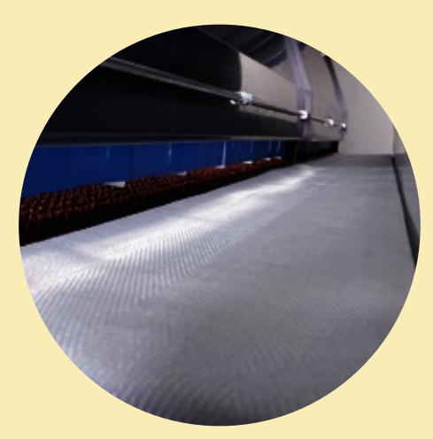
An integral part of the nest: the egg collection belts