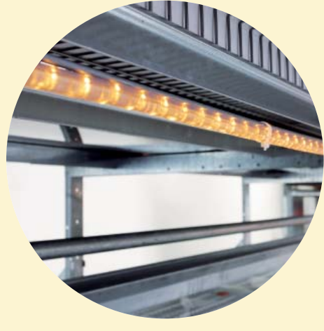
Finding feed and water more quickly: 24V LED light tubes aid orientation