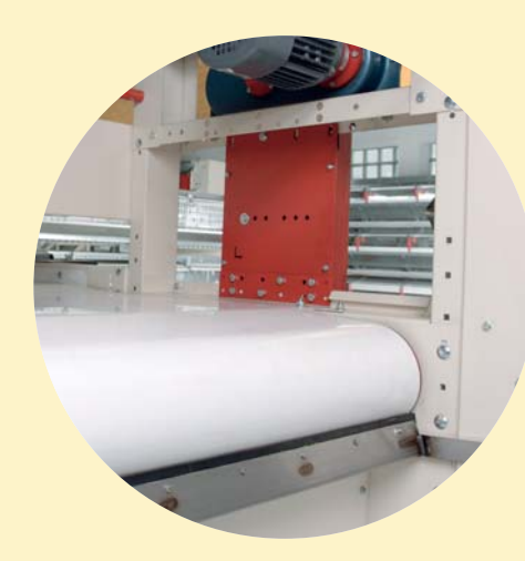
Automatic manure removal reduces ammonia and risk of infections