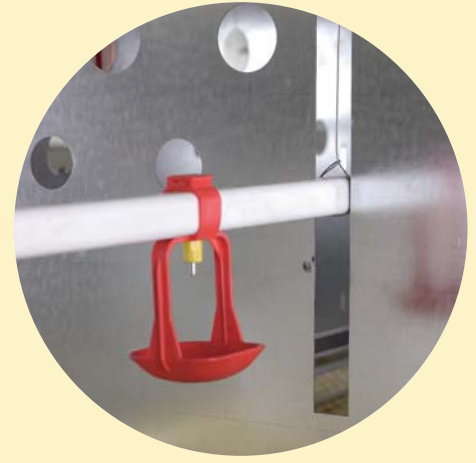
Centrally height-adjustable drinker line