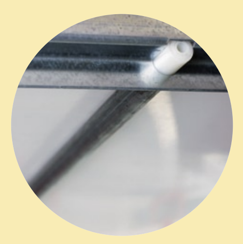
Safe and hygienic: manure removal by means of manure belts on rollers