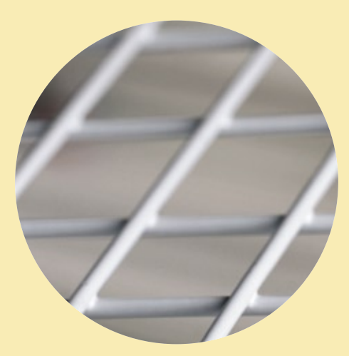
Convenient house checking: accessible mesh floors